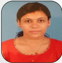
LAKSHMISREE AIR 484