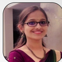
FINUMOL JOSE AIR 245