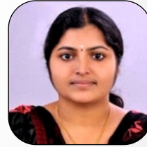
DIVYA C AIR 474