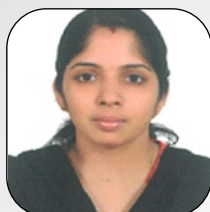
K CINI AIR 232