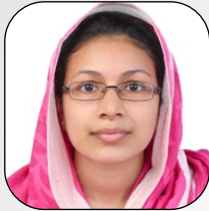
FARSANA K AIR 420