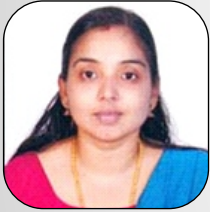
SIBINA T P AIR 466