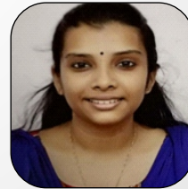
RAKHY R AIR 489