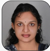
MINI M S AIR 486