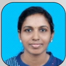
ASWATHI A AIR 494