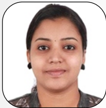
HARITHA N AIR 439