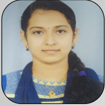
SARIGA K T AIR 383