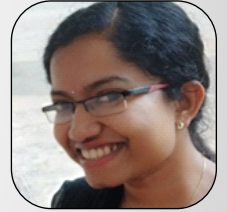
ANJU A K AIR 480